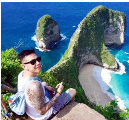
A favorite beach in Guam