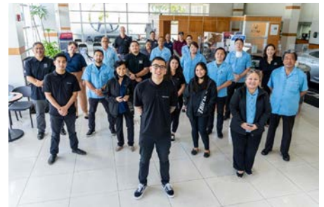
Acura Honda Sales Team