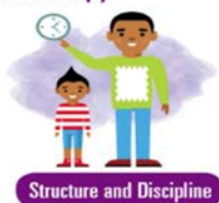
Structure and Discipline